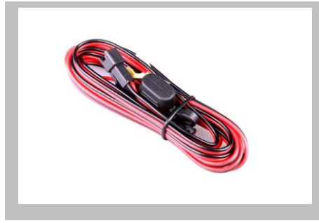
Charging cable (Standard)